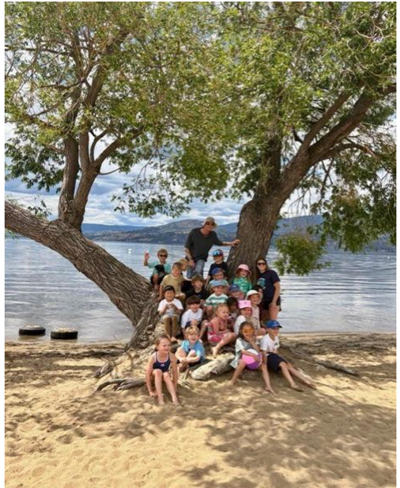
MME Anderson Beach Day