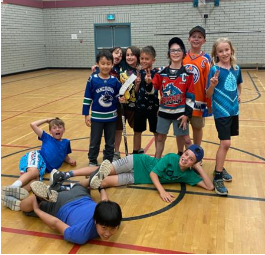
Casorso Hockey League CHL