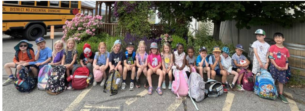
MME Berg Class to Planet Bee in Vernon